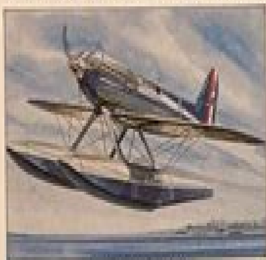
SUPERMARINE S.6B 1918

Sir Michael Beetham GCB CBE DFC AFC FRAS