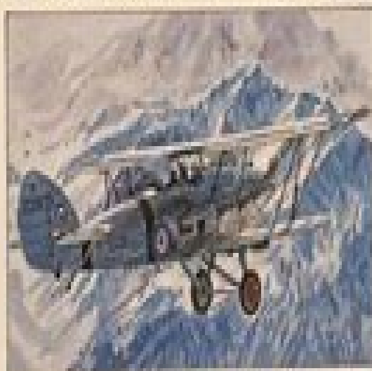
HAWKER HART 1918