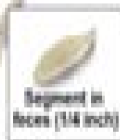
Segment in feces (1/16 inch)