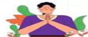
Be sensitive - Practice what you preach