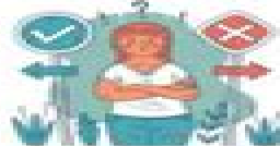
Infuse moral values