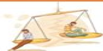
Balance positivity and realism.