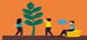
Nurture innate trust