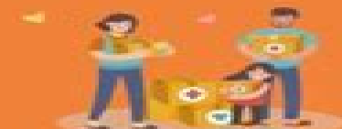
Encourage social service