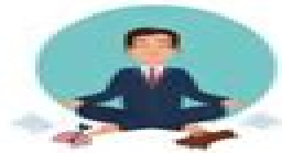
Foster a balanced personality