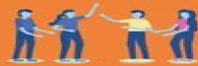
Set clear boundaries