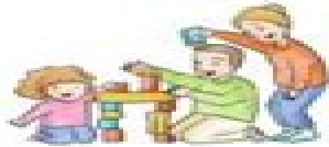
Play with kids

Good parenting considers the age of children and their stage of development. Parenting is a two-way journey: Learning from kids and teaching them. These twelve principles of parenting based on the teachings of Gurudev Sri Sri Ravi Shankar will provide a rock-solid foundation for the parent-child relationship. It will uplift your child's capacity to love, trust, discover and learn.