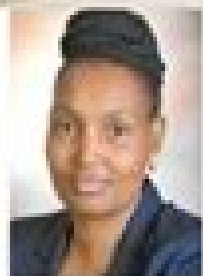
MS THEMBI NKADIMENG

MINISTER CO-OPERATIVE GOVERNANCE AND TRADITIONAL AFFAIRS