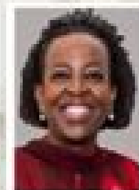
MS MAIPOENE RAMOKGOPA

MINISTER THE PRESIDENCY RESPONSIBLE FOR PLANNING, MONITORING AND EVALUATION