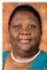
MS NOMOLO KIVELA

MINISTER THE PRESIDENCY RESPONSIBLE FOR WOMEN, YOUTH AND PERSONS WITH DISABILITIES