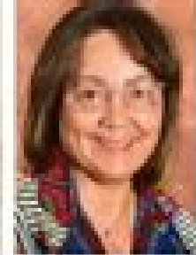
MS PATRICIA DE LILLE

MINISTER COMMUNICATIONS AND DIGITAL TECHNOLOGIES