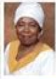
DR NKAGAZANA DLAMINI ZUMA

MINISTER THE PRESIDENCY RESPONSIBLE FOR PLANNING, MONITORING AND EVALUATION