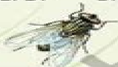
FLY / HOUSEFLY