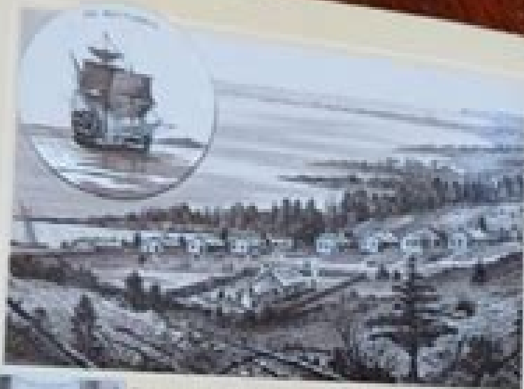
THE FIRST STREET IN PLYMOUTH