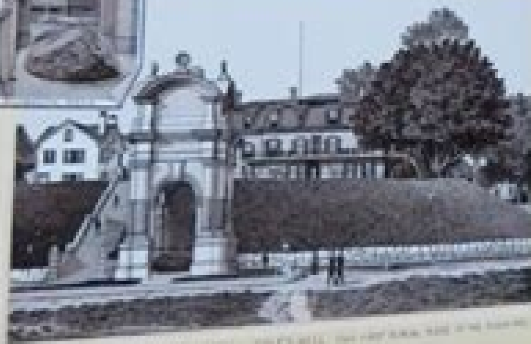
CUSTOM HOUSE OVER PLYMOUTH DOCK. LEFT WITH THE FIRST BARRACKS OF THE BARRACKS